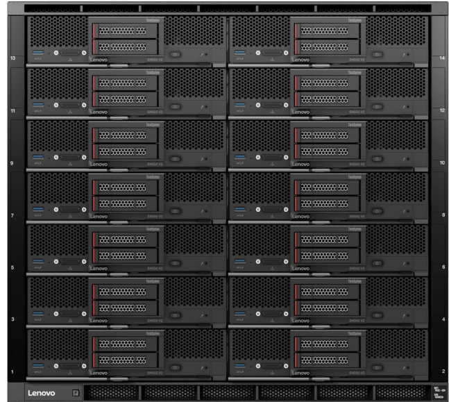
The Flex System Enterprise Chassis houses up to 14 SN550 V2 compute nodes, delivering high density.

Flex System saves time and money by greatly reducing your costs for energy, floor/rack-space, and by simplifying management. Reduced complexity enables your infrastructure to become a powerful tool—ready for the future—instead of a drain on resources.